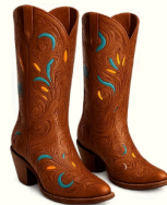
JAZZY COWGIRL BOOTS