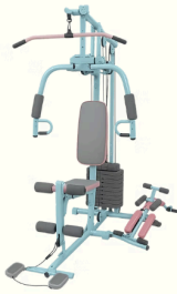
FLEX FULL BODY WORKOUT SYSTEM