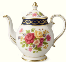
QUEEN OF ENGLAND TEAPOT